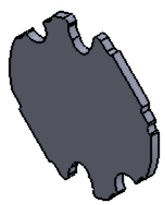
3D View Scale:- 2:1