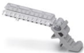
The figure shows a combination of versions AK-DST-UK marker label and ESL 24 x 4 insert strips

Marker label, for marking groups of terminal blocks with the top marker groove at an angle of 45° e. g. UK terminal blocks, snaps into the marker groove, the marker carrier can be swung over by 120° and is labeled with EST 24 x 4 or ESL 24 x 4.