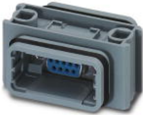
D-SUB coupling, shell size 3, socket, gender changer, shielded, connection direction straight, IP67 degree of protection

Please be informed that the data shown in this PDF Document is generated from our Online Catalog. Please find the complete data in the user's documentation. Our General Terms of Use for Downloads are valid ( http://download.phoenixcontact.com )