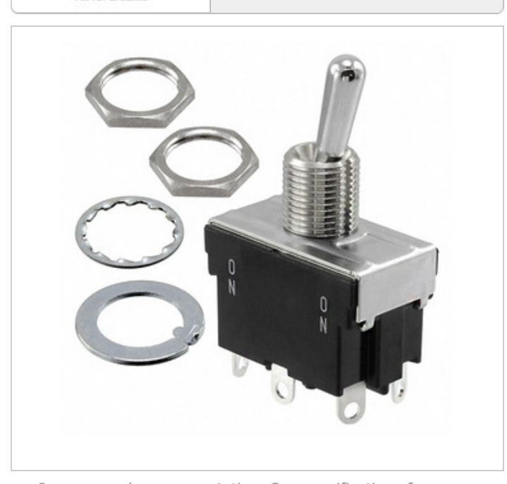
Image may be representation. See specifications for product details.