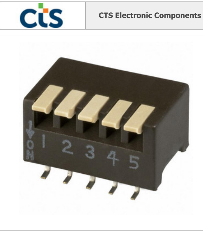
Image may be representation. See specifications for product details.